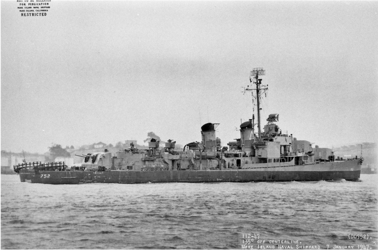
112-17 (DD752) 135° OFF CENTERLINE. MARE ISLAND NAVAL SHIPYARD 7 JANUARY 1947.

NOT TO BE RELEASED FOR PUBLICATION MARE ISLAND NAVAL SHIPYARD MARE ISLAND, CALIFORNIA RESTRICTED