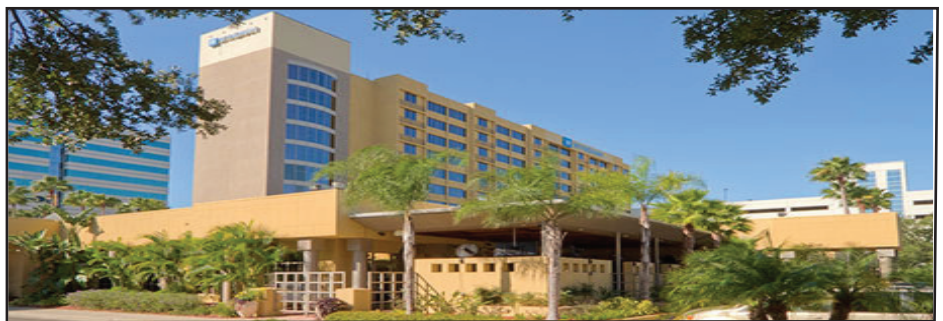
Wyndham Tampa Westshore Hotel in Tampa, Florida